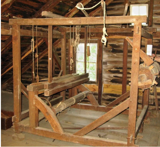
The loom in the attic: before.....

The Salmon Brook Historical Society (based in the rural town of Salmon Brook, Connecticut, USA) was established in 1945, with the aim of preserving local history for future generations.